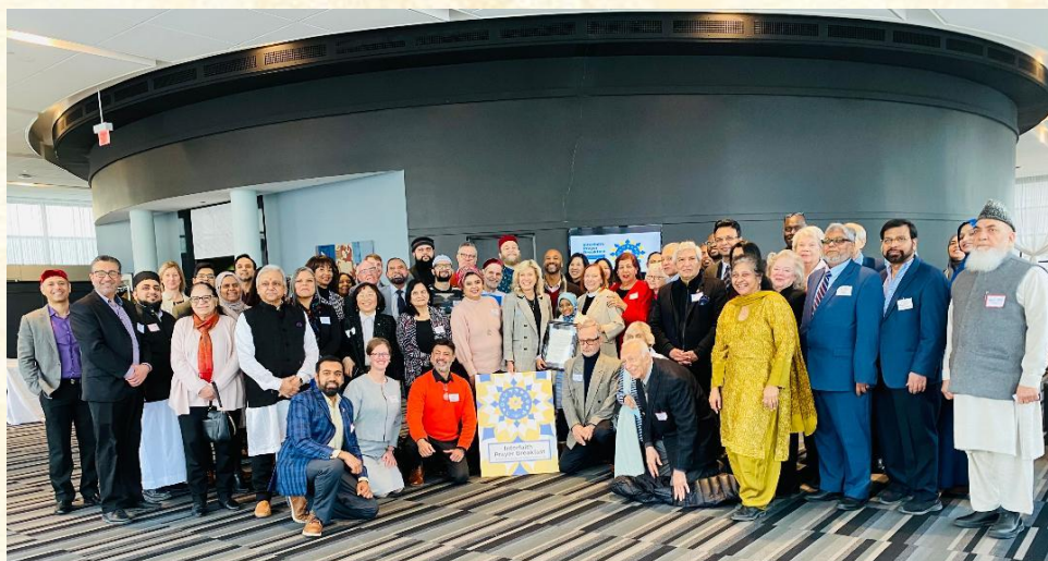
UNs World Interfaith Harmony Week organized by MOZAIC