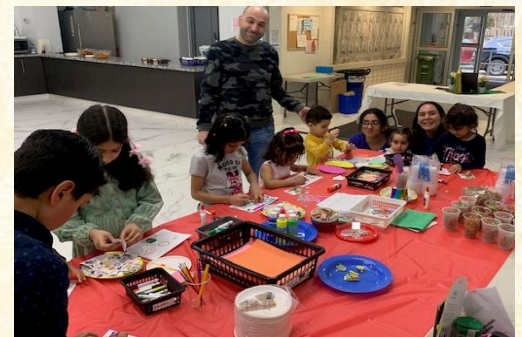
Religion Class Norooz Party

Remember to save the date Sunday July 9, 2023 for the next ZSO AGM to be held at the MGDM... SO PLEASE RENEW YOUR ZSO MEMBERSHIP TODAY!