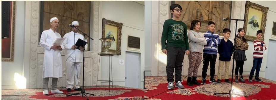
Prayers and Children Singing