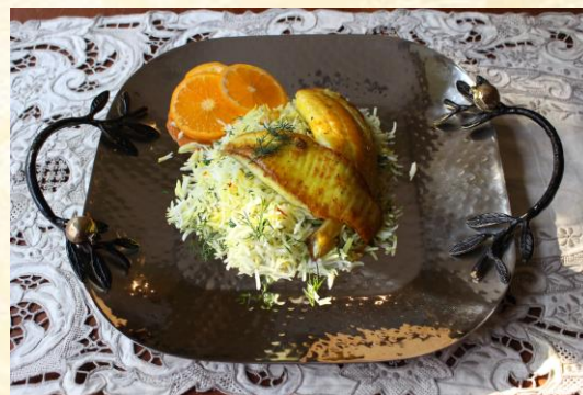
Mahi Polo - Fish and Rice

Growing up, Navroze in Karachi meant a set of new clothes, a holiday from school, prayers at the fire temple, and then visits to the family elders. We spent the day indulging in eating sweets (mithai), particularly sutarfeni, which was always freshly made for the event by the stores across from the agiary, our fire temple. We would receive a bit of cash in a parika from grandparents and loving aunts—always with shiny, crisp, new notes straight out of the bank stuffed in a white envelope with bhali duas (good wishes) and always written in red ink, considered sagun nu or auspicious. It was never about the money, but about the excitement of having something to look forward to.