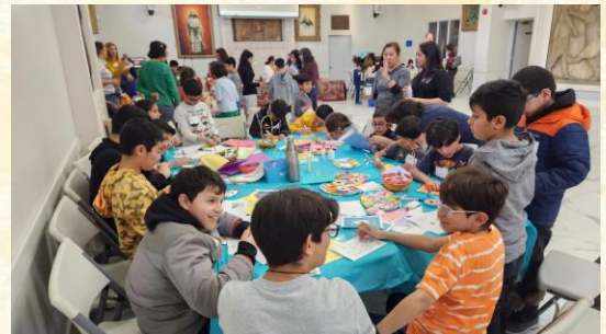
Norooz Religion Classes Party